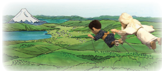
Flying through the mountains with God