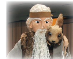
Meeting God on the mountain